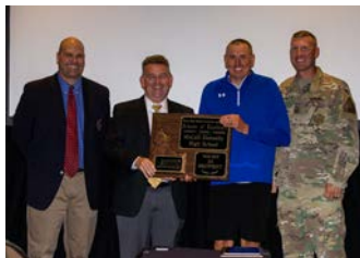
2A - McCall-Donnelly HS