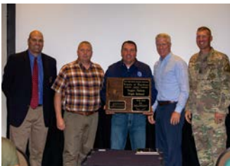
3A - Sugar-Salem HS