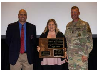
1A DII - Lighthouse Christian HS

The Idaho High School Activities Association is pleased to continue the “Schools of Excellence” Initiative, whereby schools earn points based on their varsity teams’ achievements in the classroom, at the competitive venue, and in the area of citizenship/sportsmanship.