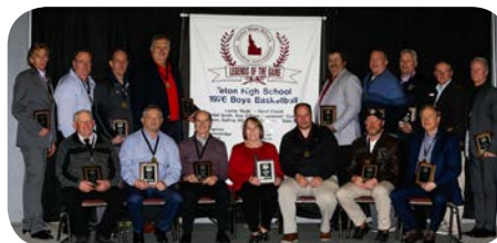
1976 Teton HS