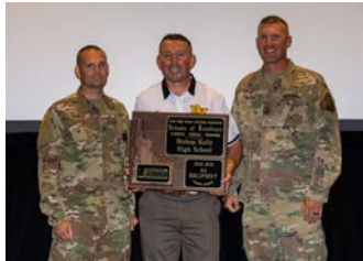
4A - Bishop Kelly HS