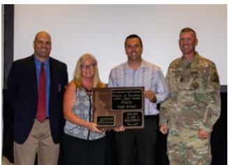
1A DI - Prairie HS