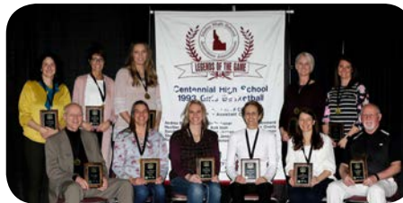
1993 Centennial HS