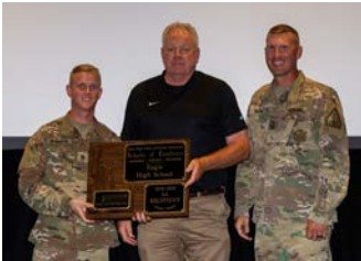
5A - Eagle HS

Sponsored by the Idaho Army National Guard